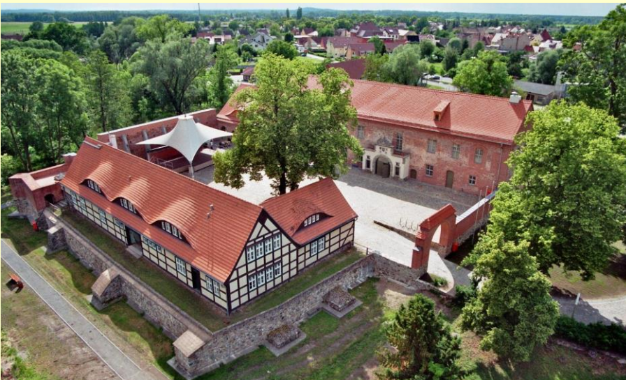
(Storkow castle – location of prize giving ceremony)

Less than 25 km to the biosphere reserve Spreewald. The unique natural landscape with its beautiful waterway network is truly worth a boat ride. www.spreewald.de